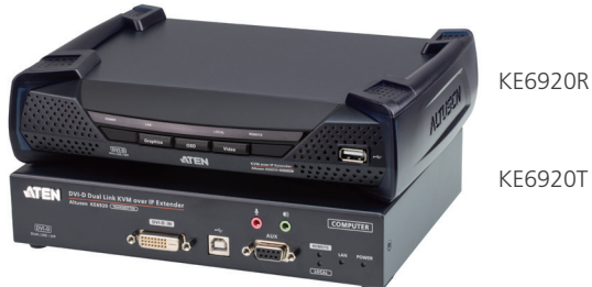
KE6920R / KE6920T Front View