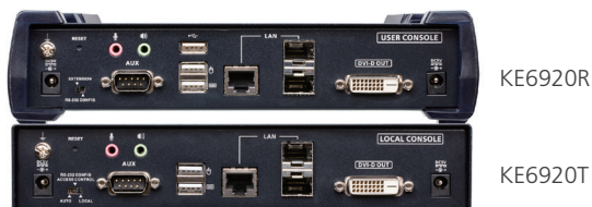
KE6920R / KE6920T Rear View