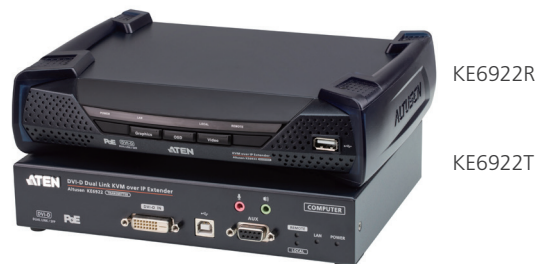
KE6922R / KE6922T Front View